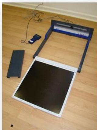
LASAR Posture (Otto Bock)

The LASAR Posture (Otto Bock Healthcare) is a force sensing platform that projects a laser line to visualise the position of the amputee's centre of gravity line. Understanding the position of this line helps prosthetists optimise the standing alignment of lower limb prostheses.