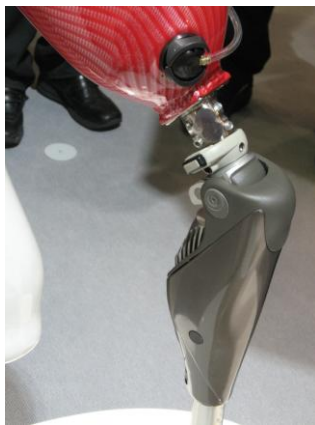
The New Otto Bock Genium Knee

A core group of APC Prosthetics personnel recently attended the ISPO world congress in Leipzig, which coincided with the world's largest prosthetics exhibition show. There were about 600 exhibitors from around the world and there were more than 15,000 delegates from all corners of the world.