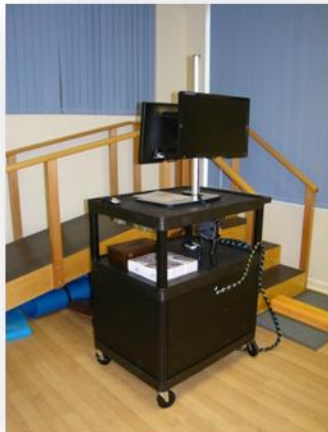
Siliconcoach Video Analysis Station

APC Prosthetics has recently acquired some exciting new equipment - the Siliconcoach Video Analysis System, Compas™ (Orthocare Innovations) and L.A.S.A.R Posture (Otto Bock Healthcare), which will help the prosthetists maximise socket fit, prosthesis alignment and amputee gait, as well as being a useful educational tool for new prosthetists and students. This equipment will also be an integral part of the many new research activities beginning at APC.