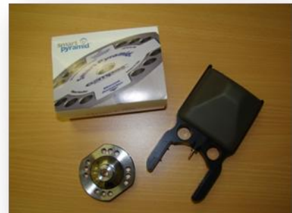
Compas (Orthocare Innovations)

The Compas™ is also a gait analysis tool which allows the prosthetist to use real-time gait analysis data to optimise prosthesis alignment for each individual. The Compas software collects and interprets data collected from a patient walking with their prosthesis and provides information to the prosthetist, including recommended adjustments to the prosthesis in order to improve the walking pattern.