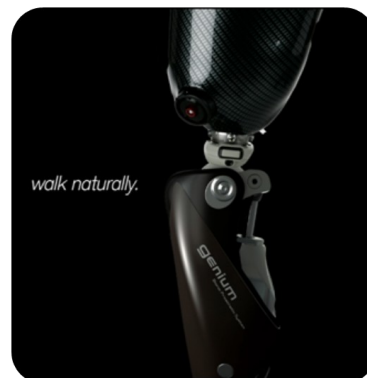
Experience the next Generation