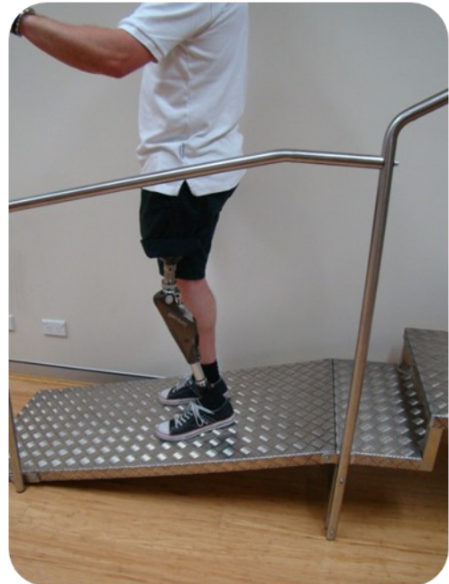
The knee provides greater safety &

After initially seeing The Genium™ and all the hype around it at Leipzig (conference in Germany) I had been eagerly anticipating it's Australian launch. We always knew it was the next big leap in technology but after seeing it in far more detail at ISPO and a training day at Otto Bock I am even more excited. I had not anticipated the huge range of above-knee clients this knee will benefit not only by increasing their function but dramatically increasing their safety. Really exciting stuff."